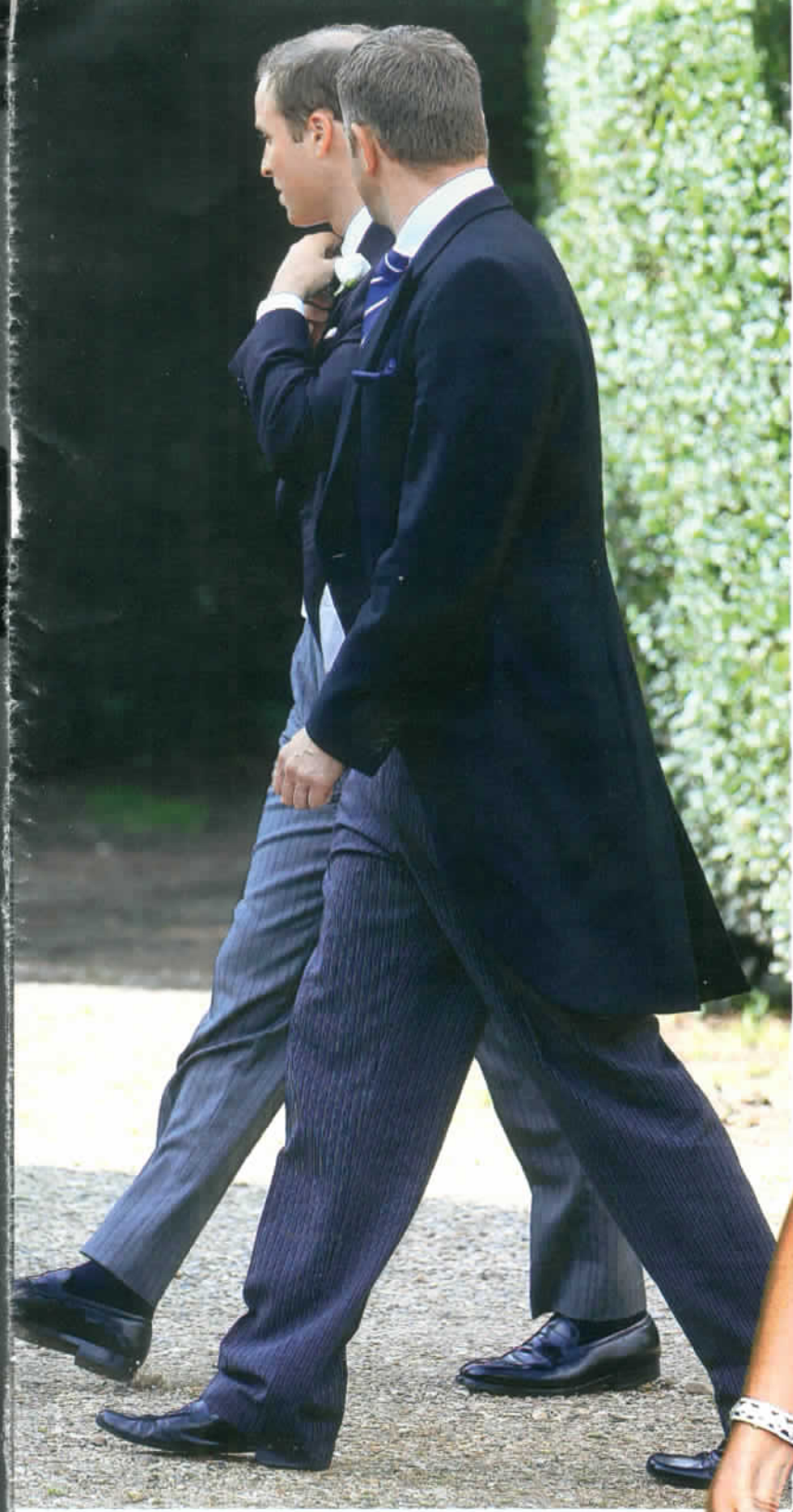
The Duke of Cambridge arrives to do duty as an usher (above, with a friend). Kate's sheath dress and matching pillbox hat (right) "literally stopped people in their tracks", said a local