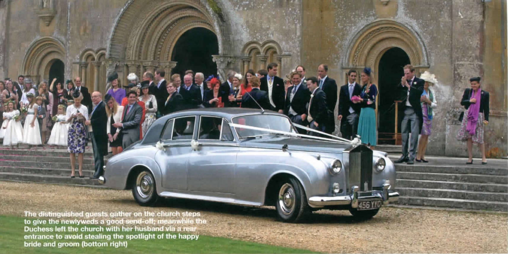
The distinguished guests gather on the church steps to give the newlyweds a good send-off; meanwhile the Duchess left the church with her husband via a rear entrance to avoid stealing the spotlight of the happy bride and groom (bottom right)